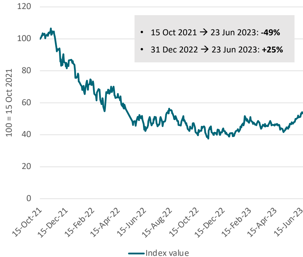
BVP Nasdaq Emerging Cloud Index